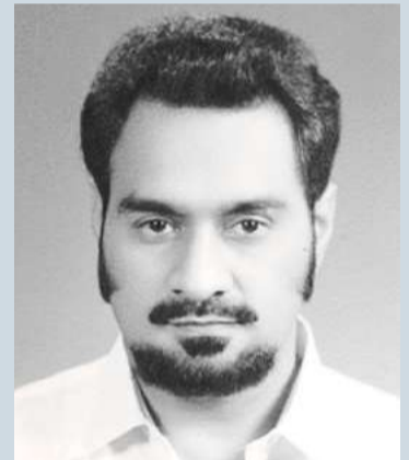
Earnest candidate: Karpal contested for the Alor Setar parliament and state seats in 1974.