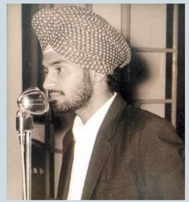
Charismatic: A young Karpal delivering a speech at the University of Singapore in 1963.