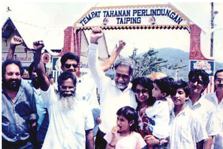
Moment of victory: Karpal celebrating with family members and supporters after his release from ISA detention in 1989.