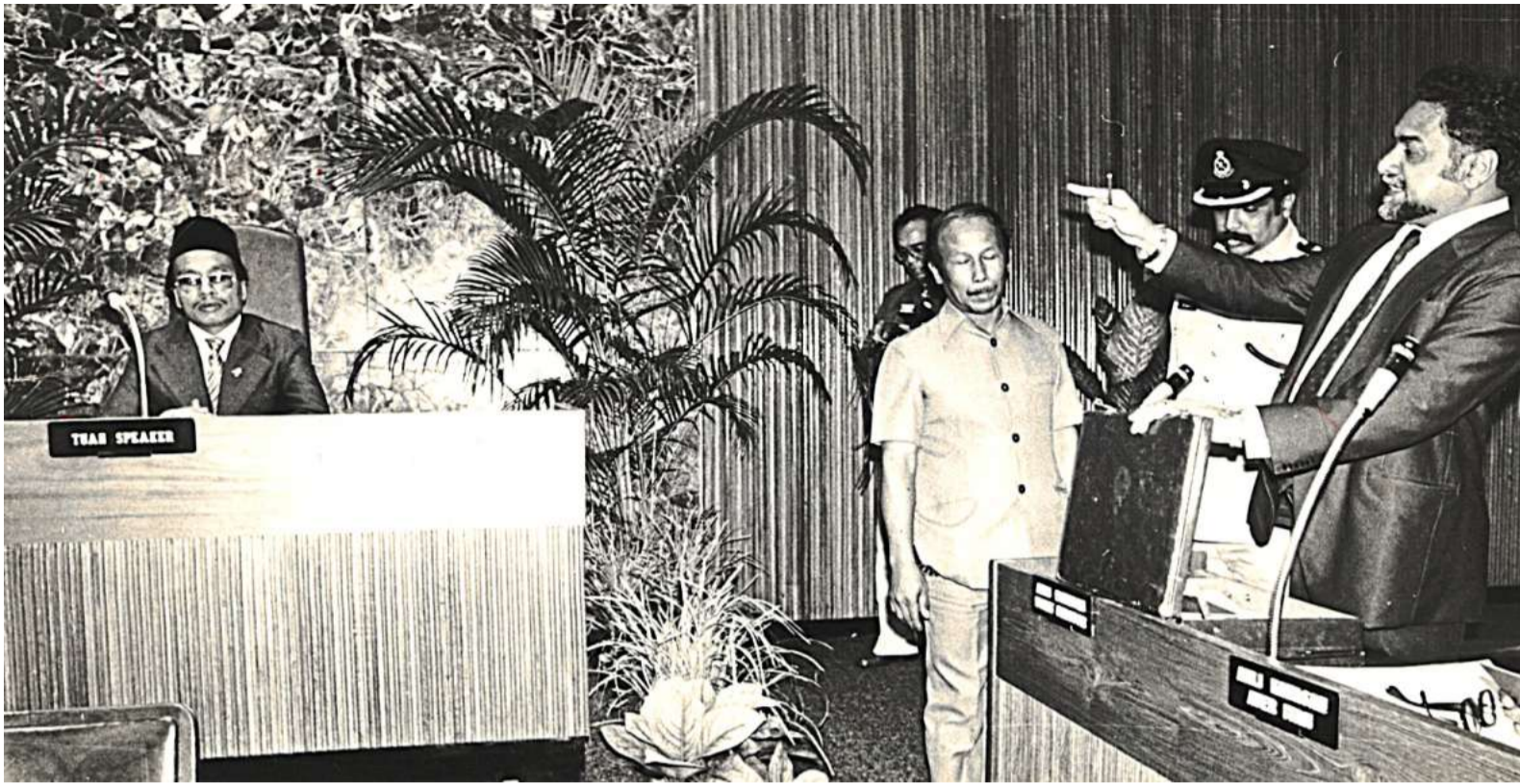
Standing his ground: Karpal telling the Speaker: "I have a right to be here" as the police wait to escort him out in May 1981.