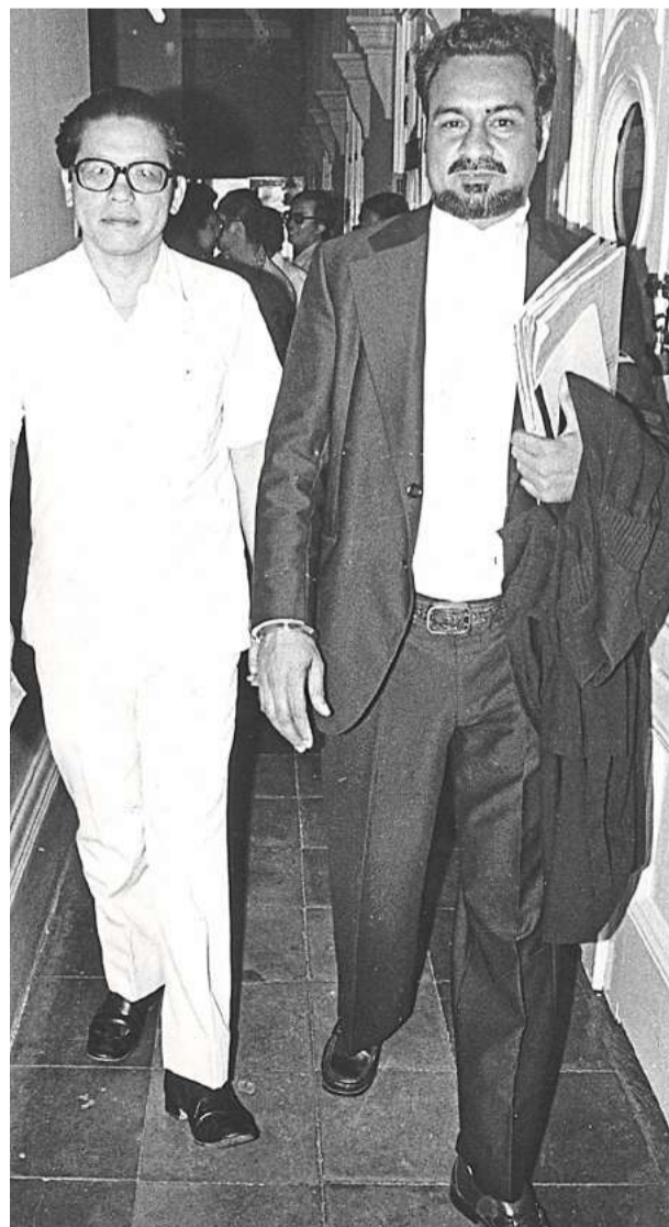
Old friends: Karpal with Lim Kit Siang in 1978.