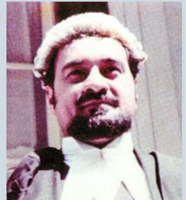
Proud to serve: Karpal donning his lawyer's wig in the 1970s.