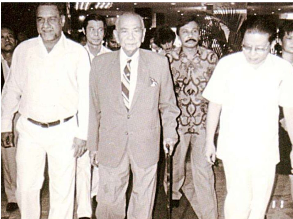
Three's company: Karpal with Tunku Abdul Rahman and Lim Kit Siang in the late 1980s.

Over the decades, Karpal Singh left his mark on the Malaysian scene as a lawyer and politician.